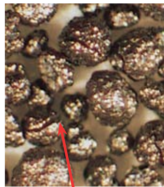
Particles Before Coating

The photo below is a magnification of Loresco SC•2